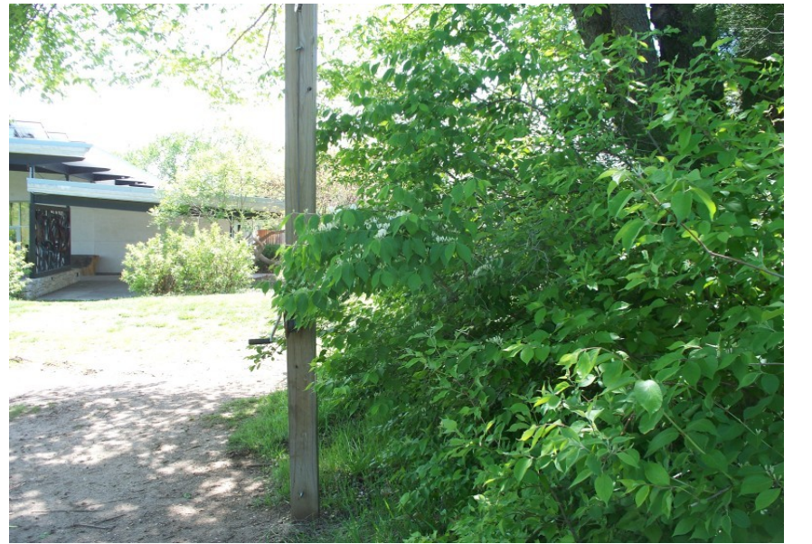
Brook Creek Woods