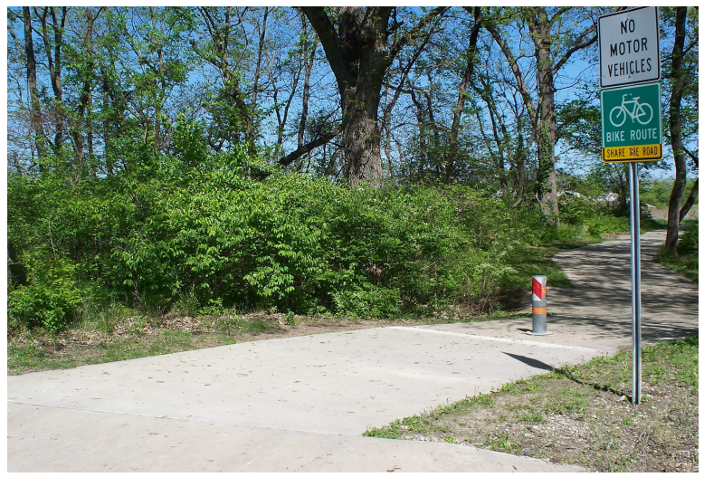
SLT Trail at Kasold