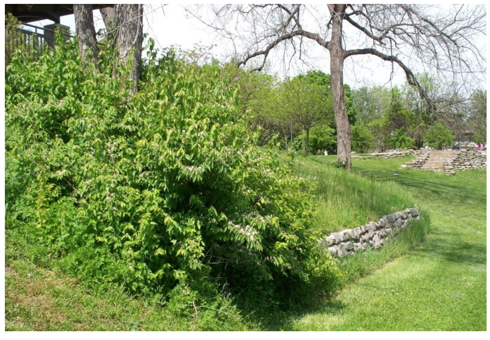
Centennial Park, Skate Park